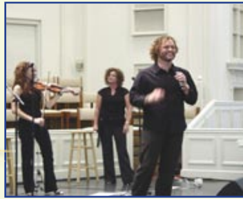
David Phelps, opening concert sponsored by Lifeway Music