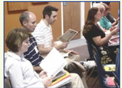
Conferees enjoy a choral reading session

The Baptist Church Music Conference held its 50th anniversary meeting in Nashville, Tennessee in 2006. Our host church was Forest Hills Baptist Church in Brentwood. Here are some photographs from this historic conference.