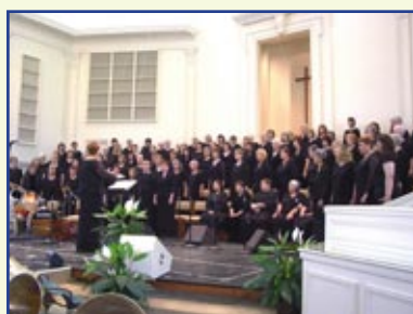
The Singing Women of Texas in concert