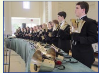
Youth Handbell Choir, FBC Pensacola, Florida